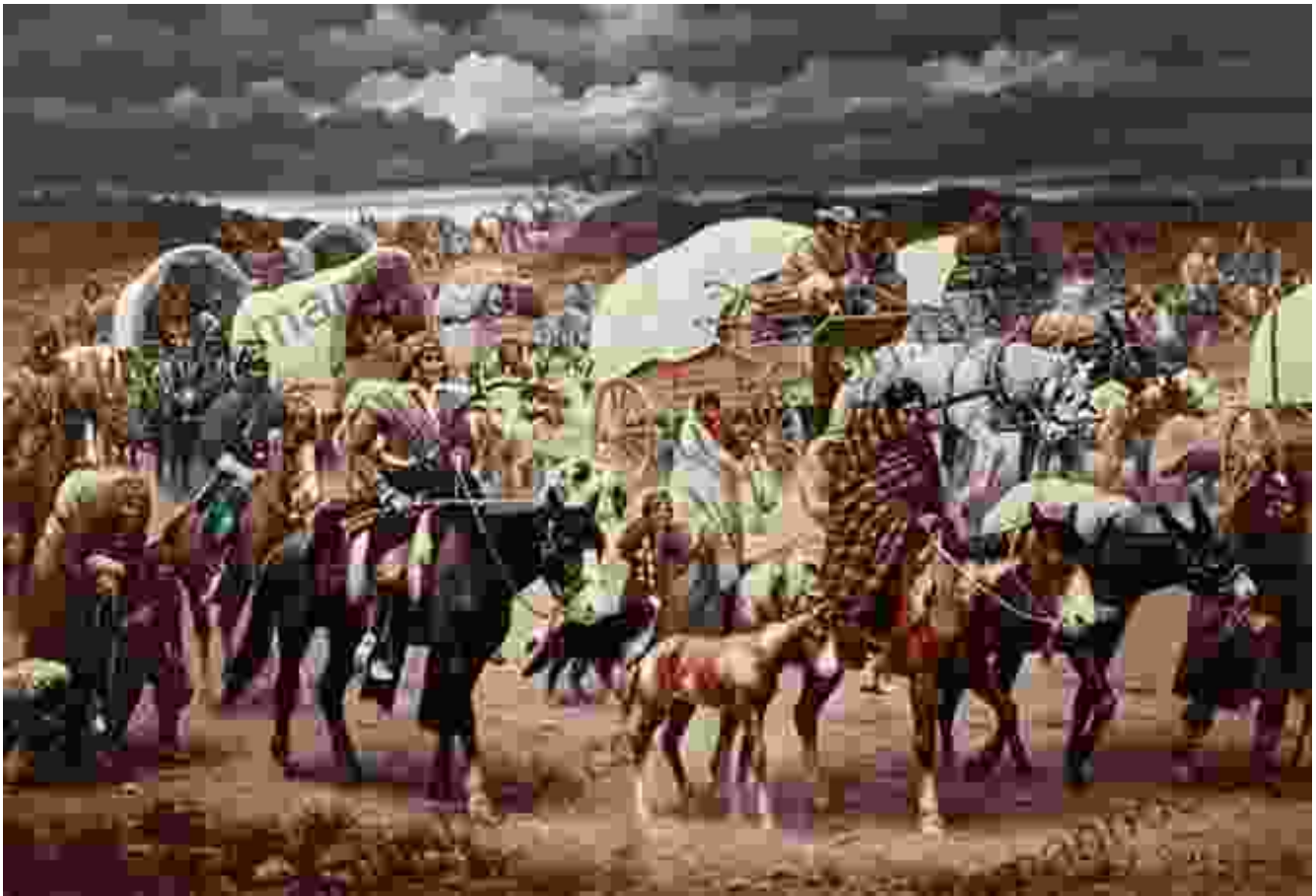
Forced Removal of Native Americans on the Trail of Tears

Americans from their ancestral lands and the establishment of reservations further marginalized and oppressed them.