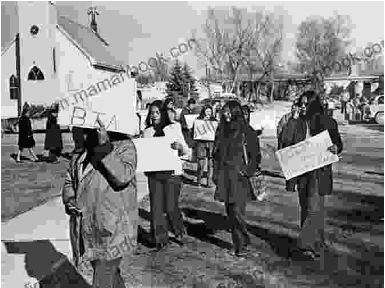
Native American Activism at Wounded Knee

(AIM) emerged as a voice for Native American rights and cultural revitalization.