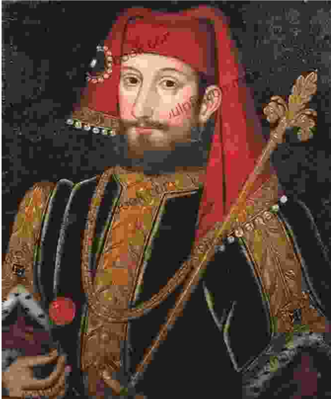
Prince Hal from The First Part of King Henry IV

flawed individual. Prince Hal is a rebellious and irresponsible youth, but he eventually proves himself to be a worthy heir to his father's throne. Falstaff is a comic figure, a fat and drunken knight who provides comic relief to the play's darker moments.