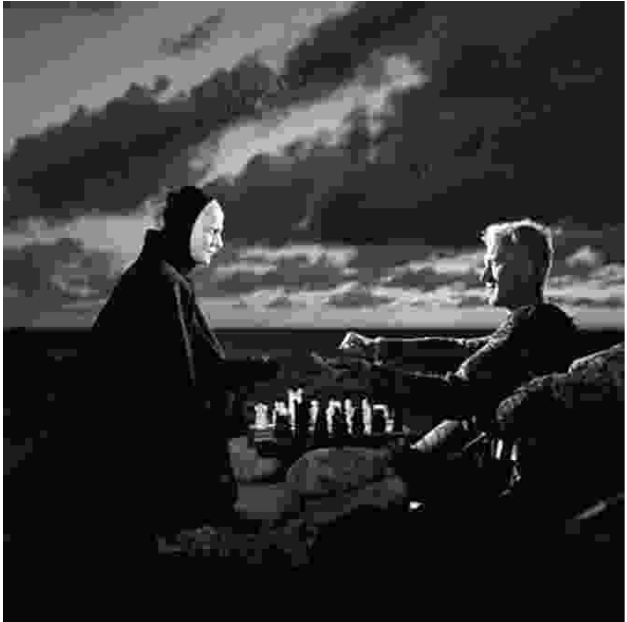
Antonius Block in 'The Seventh Seal'