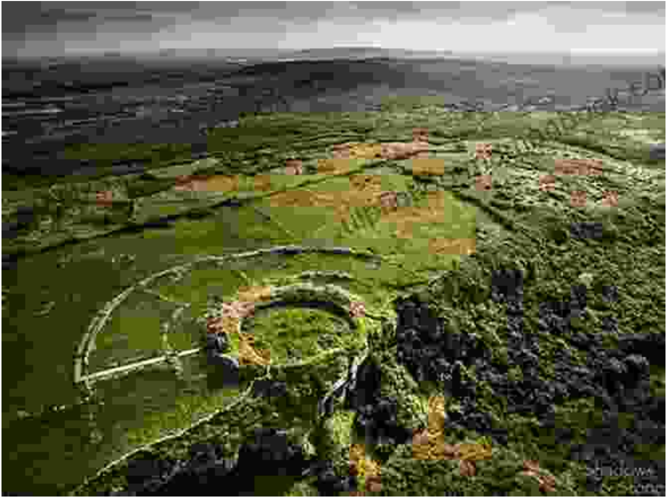
Circular stone ringfort, a testament to Iron Age habitation in the Burren.